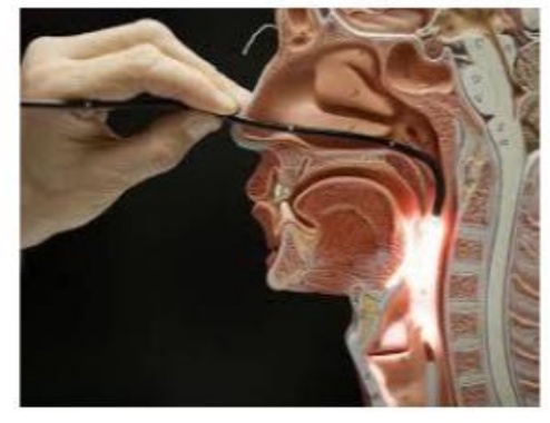
Fig. 3 Nasal Endoscope

• Fine Needle aspiration - An alternative to biopsy in cases where a lump is seen on the outside. The doctor can take the sample directly from the lump using a needle in an outpatient setting.